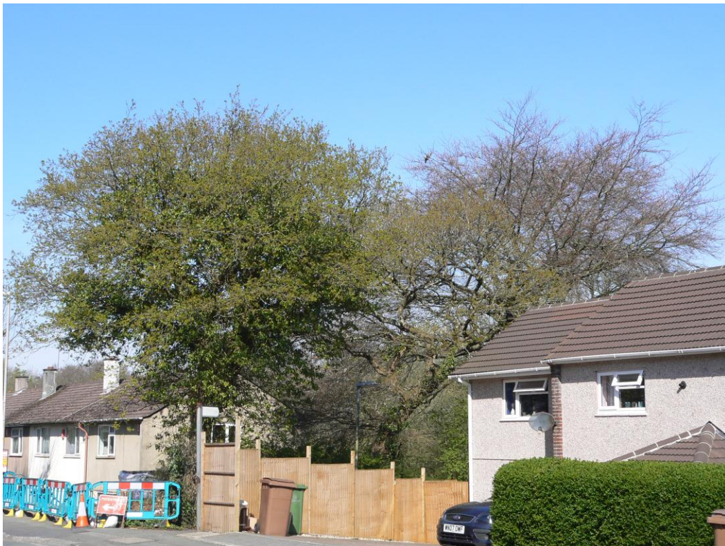
Tree Preservation Order No. 500 viewed from St. Pancras Avenue